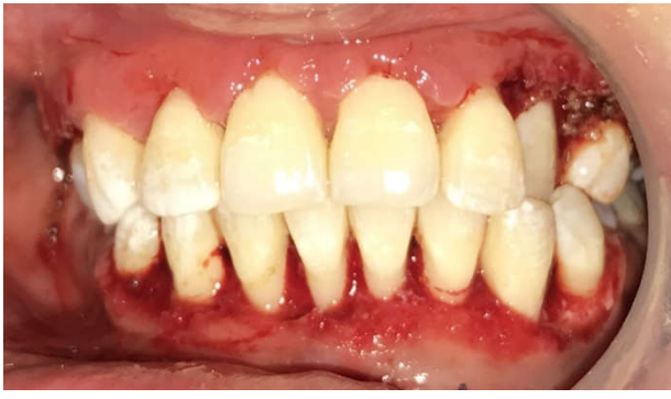
Figure 3 Intraoperative view