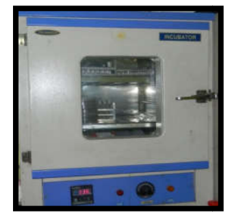
Fig 2 Incubator

Fig 1 Inoculation of microorganisms using automated micropipette