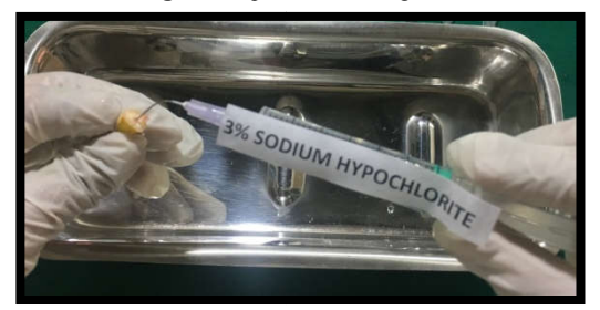
Fig 4 Group 2- Sodium hypochlorite irrigation