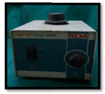
Fig 7 Cyclomixer