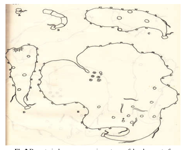
Fig 2 Dryopterischrysocoma, various stages of development of gametophyte and Position of sex organs