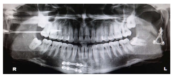
Fig 2 OPG showing fracture reduction with Delta plate

Postoperative radiological examinations were carried out with OPG (Fig.2 and Fig. 3) and Open mouth Reverse Towne's view to examine the progress of bony consolidation, quality of anatomical restoration and mechanical failures of the osteosynthesis material (degree of secondary displacement, loss of ramus height, plate fracture/bending and loosening of the screws).