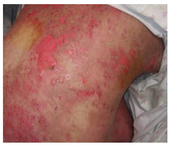
Fig 1 Lesions on back of the body

Cutaneous Examination : Hyperpigmented, wealed lesions in the mouth, over the upper limbs, trunk, back, abdomen and crusted plaque over the scalp.