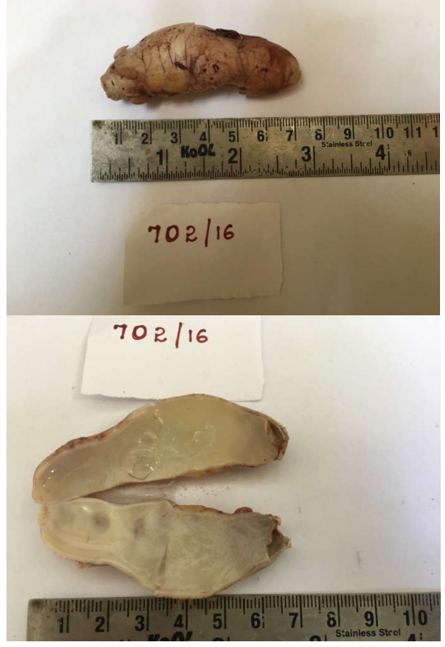
Figure 1 & 2 Surgical Specimen: Appendix With Thinned Out Wall And Dialated Lumen Filled With Mucoid Material.

* Corresponding author: Radhika Yajaman Gurumurthy Consultant Pathologists, Bhagavan Pathology Laboratory, #1116, 5TH CROSS, 1503, Srirampet, Vinoba Road, Mysore - 570001