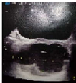
Figure 1 Vesico prostatic ultrasound showing a prostatic abscess collection measuring 80mm × 63mm.

It is a 65-year-old patient with a history of type 2 diabetes with oral anti-diabetic drugs and a cataract of the right eye operated 8 months ago. This patient presents for 2 years an obstructive syndrome of the lower urinary tract with a dyschesis. The rectal examination showed a prostate enlarged, firm, and renal. The prostate-specific antigen was greater than 100 ng / ml. Renal vesico prostatic ultrasound showed a prostate gland of 253 g, a post-voiding residue at 206 cc with no repercussions on the upper urinary tract, and also demonstrated the presence of a prostatic abscess collection measuring 80 mm × 63 mm (Figure 1).