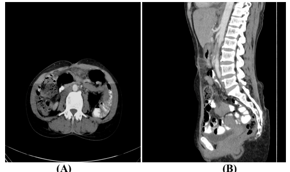
Figure 1 Focal fat stranding with inflammatory changes in the left para-sagittal and paraumbilical, omental region.

infarction, appendicitis and less commonly mesenteric panniculitis.<sup>1,2</sup> In conclusion, in a patient presenting with sharp, localized, acute abdominal pain unassociated with nausea, vomiting, fever or laboratory values typical of acute abdomen, a differential diagnosis of PEA should be entertained, and a CT scan abdomen should be performed to clinch the diagnosis.