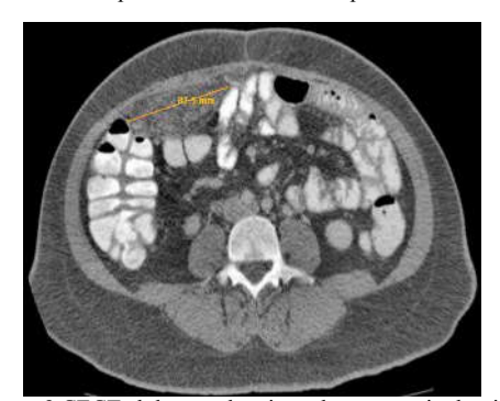
Figure 3 CECT abdomen showing a large mass in the right mesentery with stranding of fat within and surrounding it.