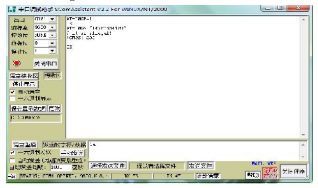
Figure 4 Control the process of text

messaging success show like <sup>[4]</sup>.On the desktop interface as shown in the figure below.