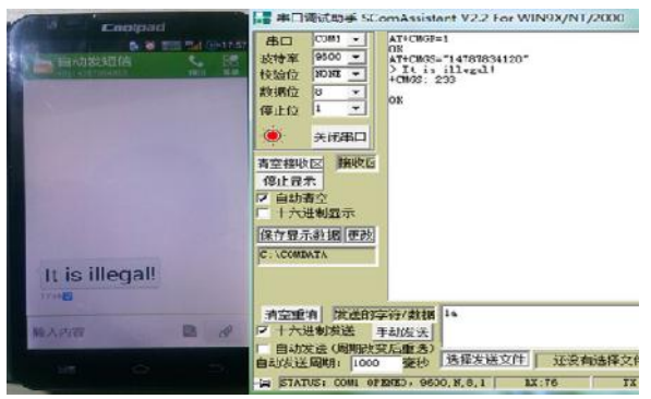
Figure 5 Contrasting send SMS and receive

With illegal programming when the automatic text messaging software, you can by use SMS (" It is illegal! ")