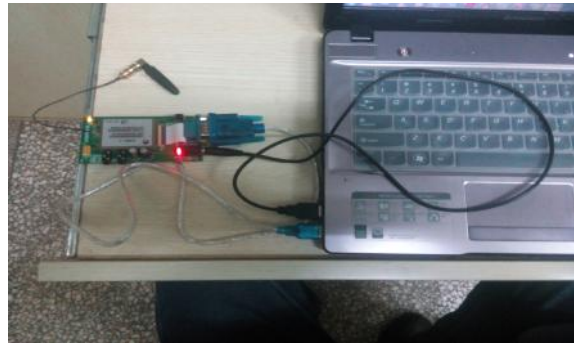
Figure 3 Connect and debug the GSM/GPRS module

Firstly, as shown in figure to GSM/GPRS module connect with a computer, and open the text button control, you can see the yellow light flickering light every 3 seconds or so.