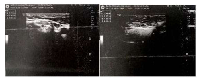
Fig 2 Ultrosonography of right Parotid gland shows an ill defined non encapsulated lesion with echogenicity and echopatternsimilar to that of fat, continuous with the adjacent subcutaneous plane and superficial parotid gland.

Patient was subjected to ultrasonography of right parotid region, which revealed an ill defined non encapsulated lesion with echogenicity and echopattern similar to that of fat, continuous with the adjacent subcutaneous plane and superficial parotid gland. (Fig:2)