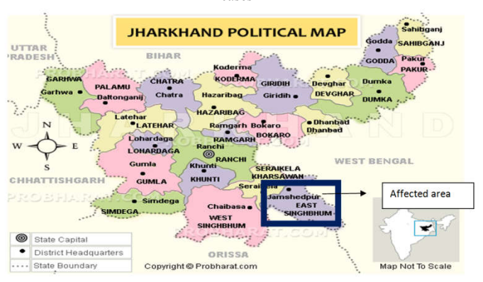
Fig 2 Political Map of Jharkhand depicting the affected area