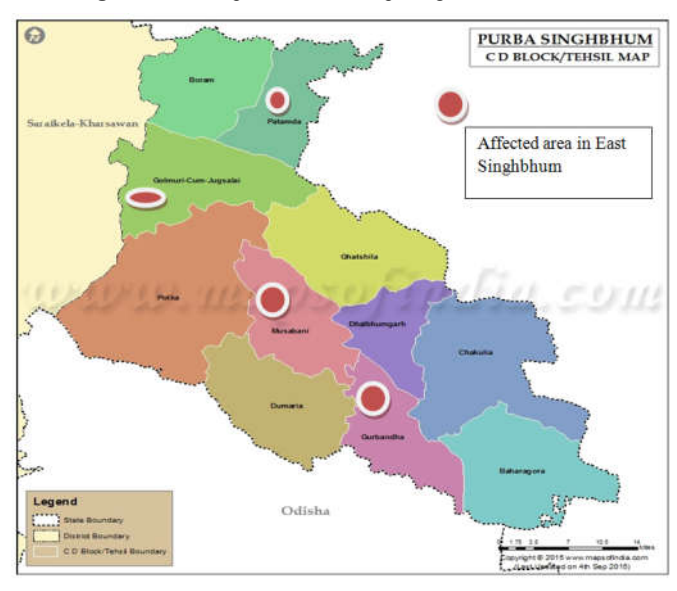
Fig 3 Affected area in the East Singhbhum with VZV infections