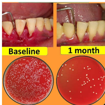
Figure 2 Quercetin group

After scaling and root planing the experimental sites was isolated with cotton rolls to prevent contamination from saliva. The experimental material (quercetin gel) in group A and chlorhexidine in group B was delivered subgingivally in the periodontal pocket as an adjunct.