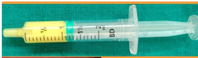
Figure 1 Quercetin gel

polymethyl cellulose) was used to prepare gel. 0.1g/mL. of quercetin was used on the basis of Minimum Inhibitory Concentration test. The weighed quercetin and HPMC was taken in a beaker. With a dropper, water was added in increments of 1 ml in the beaker with constant stirring till a gel like consistency was formed. After that the beaker was placed in a sonicator for even dispersion of quercetin particles. This gel was then loaded in a 5 ml syringe and stored in refrigerator in aseptic conditions.(Figure 1)