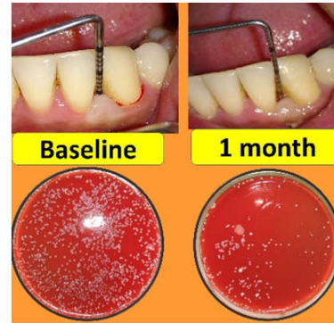
Figure 4 SRP group