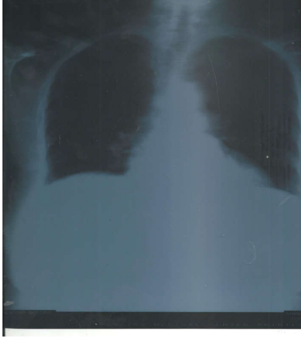
Figure 3 CXR showed bilateral obliteration of costophrenic angles and cardiomegaly

Figure 2 Diagram showed distribution of respiratory symptom