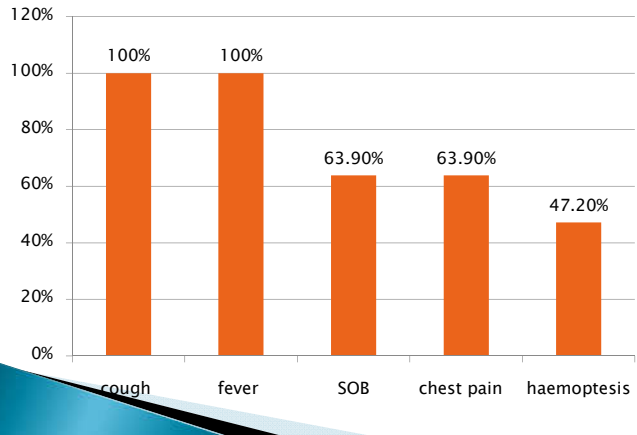
Figure 2 Diagram showed distribution of respiratory symptom