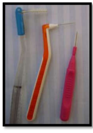
Interdental Brushes (Proxa-brush)

Systematic review by Imai PH, Yu X, MacDonald D (2012)<sup>[8]</sup> concluded that interdental brush is an effective alternative to dental floss for reducing interproximal bleeding and plaque in clients with filled or open embrasures.