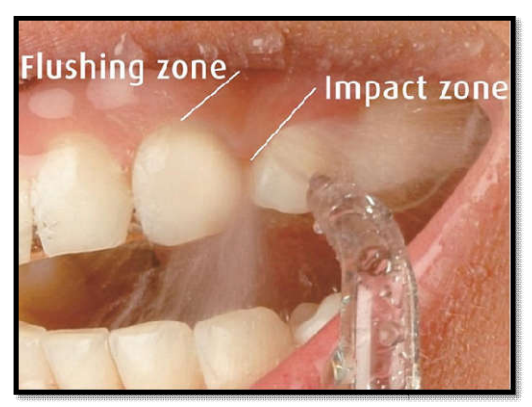
Mechanism of action of Waterpik