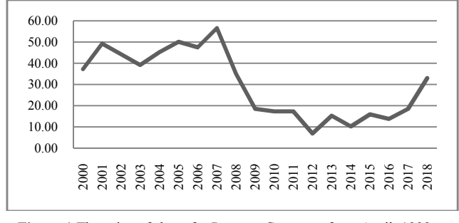
Figure 1 The price of share for Peugeot Company from April, 1999 to February, 2018 (by year in Euro currency)

A choice on a financial title (share) on a branch of industry is established on the French company Peugeot, a car manufacturer. This choice is a random choice and having for origin two reasons which are on one hand, this is a mature branch of car industry and on the other hand, the data of the prices of the share on a unit of time (day) are available from January 3rd, 2000 until January, 2018. The automobile industrial sector knew a major crisis from the end of 2007 till 2009 (problem of economic environment) and, the share price of Peugeot company was at the lowest at the end of 2013 because, it announced a net loss equal to 5 billion Euros for the 2012 fiscal year.