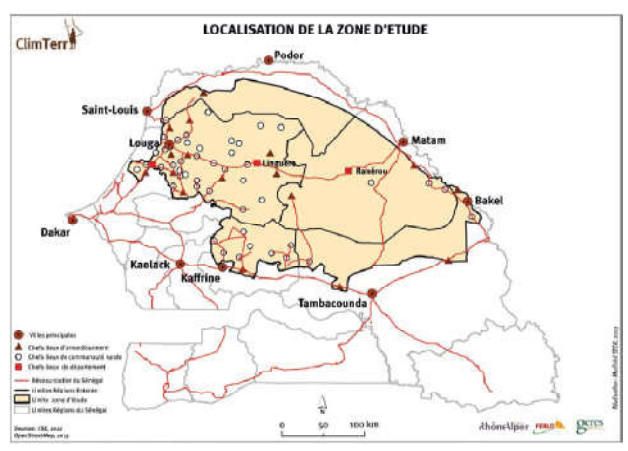
Figure 1 Ferlo zone (CSE, 2012)

Transhumance remains the most common production system among the Fulani (Adriansen and Nielsen, 2002). Families spend the wet season in the Ferlo, with the herds feeding on the green pastures and water being provided by ponds. During the dry season ponds dry out, but water is still provided by the boreholes.