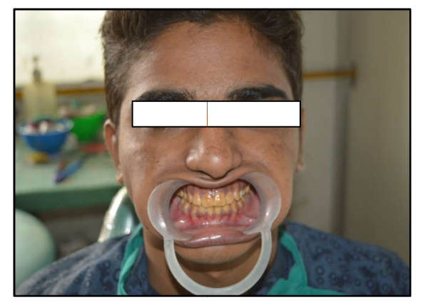
Fig 1 Showing frontal view of teeth showing

A 20-year-old boy was referred to the Department of and Implantology Swargiya Dadasaheb Kalmegh Smruti Dental College and Hospital, Nagpur. All 28 of his permanent teeth were discolored and pitted, and the incisal and occlusal surfaces showed excessive wear (Figs. 1 and 2).