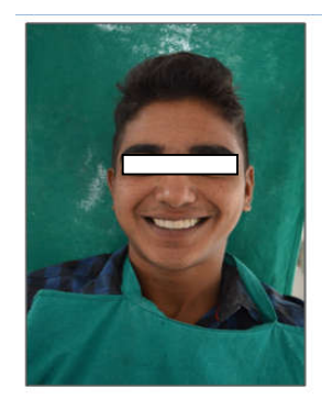
Fig 7 Showing final results after ceramic laminate veneers cementation.

At third appointment the fit of the ceramic laminate veneers were done on the prepared tooth surfaces. The prepared tooth surfaces were etched and conditioned with the Multilink N (Ivoclarvivadent), the etching of the ceramic veneers done with 9.5% Hydrofluoric acid according to recommended by the manufacturer. Then silane was applied on the cavity surface of the ceramic veneer laminate. Dual cure resin (Multilink, IvoclarVivadent) was used for the cementation of the laminates. The excess luting cement was removed with help of dental floss. Light curing done to ensure the complete polymerization of the ceramic laminate veneers. The occlusion was adjusted and surfaces were polished withrubber points and polishing paste. The patient was satisfied with the final result (Figs.7). The six months follow up shows the restorations were remained intact with healthy gingival margins, and no discoloration, crazing, or carious lesions have occurred.