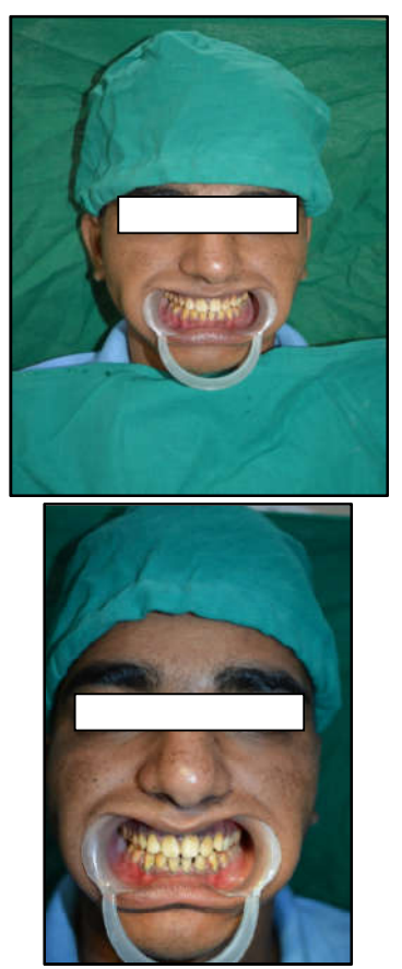
Fig 3 Prepared maxillary and Fig 4 Gingival retraction of Mandibular Anterior teethprepared teeth.

Preliminary impressions of the teeth were obtained at the first appointment for making diagnostic casts and determining a treatment plan. After all options were considered, it was determined that porcelain laminate veneers would be placed on the maxillary and mandibular six anterior teeth. Full-coverage restorations were considered as one of the treatment options, but because of the patient's age it was decided that a more conservative treatment was appropriate at this time. His posterior teeth would be restored at a later time. Shade matching was not critical because all of the teeth were affected. In collaboration with the patient, Ivoclarvivadent shade guide was used. Porcelain shade A 2 was selected for the maxillary and mandibular incisors and A3 for the maxillary and mandibular canines.