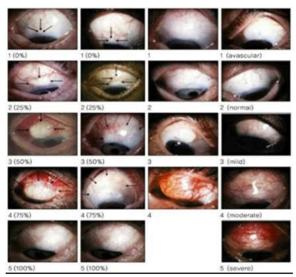
Figures 1 Moorfields Bleb Grading System

performed before and one month after surgery. All participants underwent trabeculectomy. Bleb function was considered to be successful if IOP≤18 mmHg without glaucoma medications. The limited success if IOP≤18 mmHg with glaucoma medications. The failure if IOP>18 mmHg with glaucoma medication. Conjunctiva/bleb evaluation with slit lamp biomicroscopy was performed at 1<sup>st</sup>, 7<sup>th</sup>, 14<sup>th</sup> and 30<sup>th</sup> postoperative. Biomicroscopy was used to measure bleb area with Moorfields Bleb Grading System: central bleb area (score1-4), maximal bleb area (score1-4), height (score 1-4) and vascularization (score 1-5). Two clinicians indepently evaluated the bleb. If the difference in terms of evaluation was within one, a mean was performed, if the difference was higher, the bleb was reevaluated by a third operator and a mean was taken.