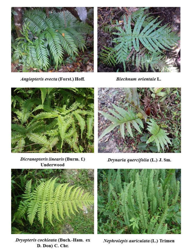
Fig. 3 Economically useful Pteridophytes from Vagamon Kurisumala