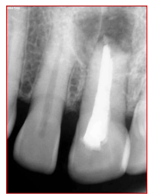
Figure 4 Six months follow up radiograph, showing reduced size of the radiolucency.

The calculus-like deposit was removed and the root surface was planed. Root-end resection and root-end filling were performed and the surgical area was sutured. Two weeks after surgery, the sinus tract was not found, and the maxillary right central incisor was asymptomatic. At the six months recall, the periapical radiograph demonstrated a reduction in the size of the radiolucent shadow around the central incisor and there was no obvious apical resorption of the root was seen [Figure 4]. On clinical examination, the patient was asymptomatic, with complete healing of labial mucosa without a sinus tract or an abscess and probing depth of the central incisor was < 3 mm.