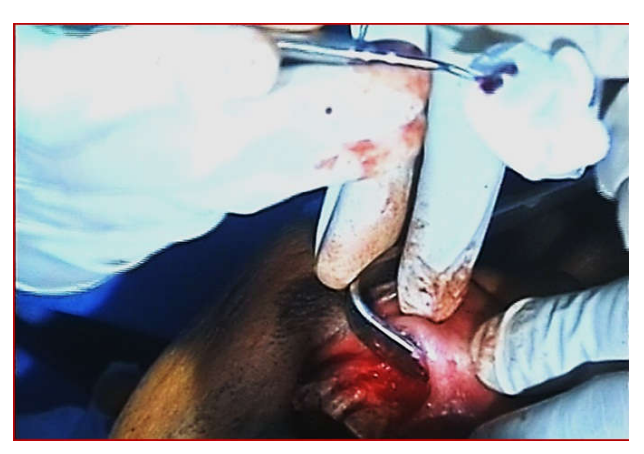
Figure 2 and 3 Dark-brown calculus-like deposit found during the surgery.

The calculus-like deposit was removed and the root surface was planed. Root-end resection and root-end filling were performed and the surgical area was sutured. Two weeks after surgery, the sinus tract was not found, and the maxillary right central incisor was asymptomatic. At the six months recall, the periapical radiograph demonstrated a reduction in the size of the radiolucent shadow around the central incisor and there was no obvious apical resorption of the root was seen [Figure 4]. On clinical examination, the patient was asymptomatic, with complete healing of labial mucosa without a sinus tract or an abscess and probing depth of the central incisor was < 3 mm.