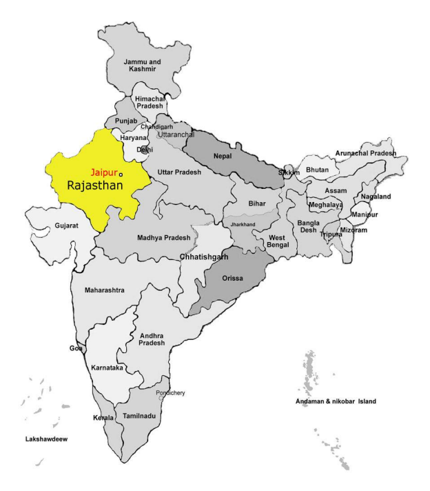
Figure No.1 Radha Krishan Birla Cancer Center, Sawai Man Singh medical College, Jaipur