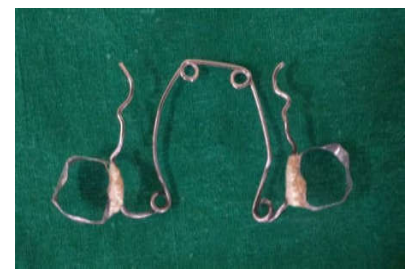
Fig 8 Quad helix appliance

Monthly activation of the modified Halterman appliance combined with Nance Palatal arch was done by replacing the elastic chains. After 2 months of the appliance placement, the intra-oralperiapical radiograph revealed 2-3 mm distal movement of the maxillary left first permanent molar and 1-2 mm distal movement of maxillary right permanent molar. After 5 months of the continued treatment ectopic eruption of both permanent molars was corrected, but the permanent first molars erupted in cross bite. To correct the cross bite Quad helix appliance was planned (Fig 8 and Fig 9).