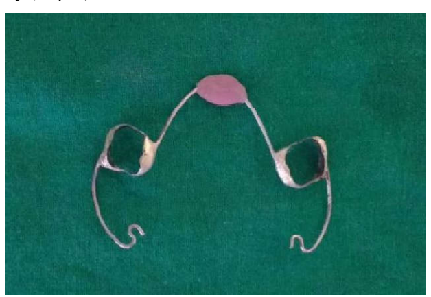
Fig 4 Modified Halterman appliance

After oral prophylaxis both right and left second deciduous molars were banded and an alginate impression was made. After stabilizing the molar bands in proper position stone cast was made. A Nance palatal arch was adapted using 0.036 stainless steel wire on the cast inorder to enhance anchorage to the appliance. An acrylic button with a diameter of 12.5 mm was incorporated to increase retention to the appliance (Fig 4). A wire component with a U-shaped bend with a distal extension consisting of a hook at the terminal end of the wire was soldered buccally to the molar bands. Wire components were adapted in such a way to prevent impingement on soft tissues. The appliance was cemented using type I Fuji (GC, Tokyo, Japan) Glassionomer cement.