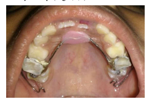
Fig 5 Immediately after appliance insertion

from the occlusal button to the distal extension hook with the help of an artery forceps(Fig 5,6,7).