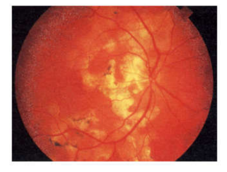
Figure 2 Serpiginous choroiditis in the right eye

Serpiginous choroiditis (Fig. 2) was the most common cause in the autoimmune group in our patients. We saw all three types of morphological presentations which included peripapillary, macular or ampiginous types.