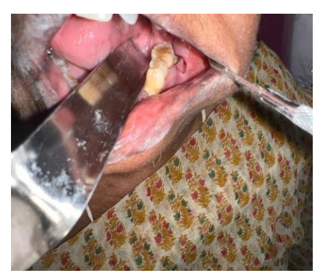
Fig 3 Unhealed extraction socket and bone exposure seen in region of 38 with no ulceration or proliferative growth

On intra-oral examination, Restricted mouth opening (25mm) noted, (Fig, 2.) Large unhealed open cavity with bone exposure noted in the region of 37, 38. (Fig, 3.)