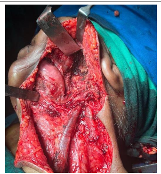
Fig 6 Wide local excision of lesion, Hemimandibulectomy and Modified radical neck dissection done