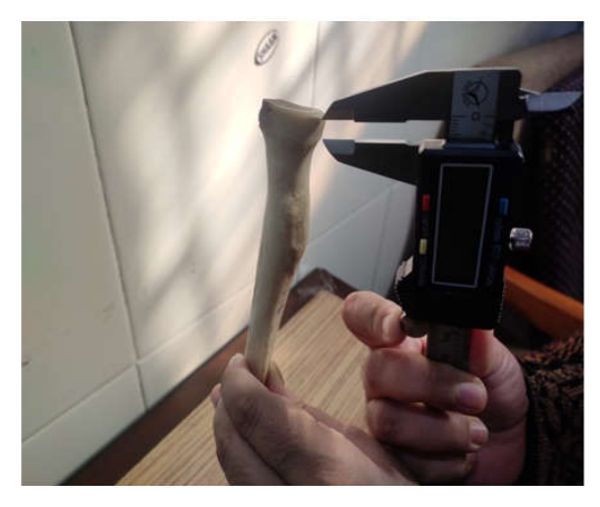
Diagram 1 showing measurement of thickness of ventral curve (TVCl by digital vernier caliper