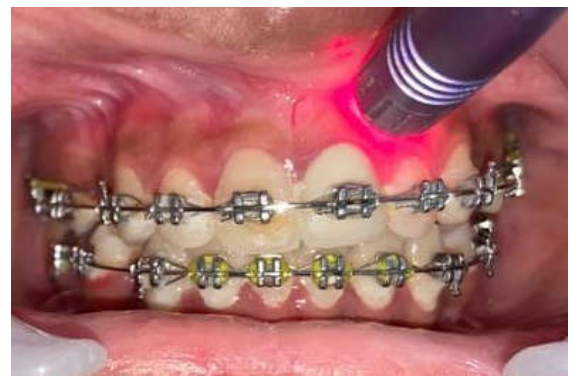
Fig no 2 980nm diode laser for Photobiomodulation

Low-level laser therapy (LLLT) helps in reducing the treatment duration as Orthodontic treatment can take an average of 14 -24 months treatment time. A longer duration of treatment has often been associated with complications such as white spot lesions, caries, periodontal problems, loss of patient cooperation, and moreover impact on aesthetics and social life and might even lead to discontinuation of orthodontic treatment.