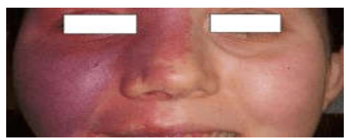
Figure 1 cutaneous planar angioma occupying the territory of the right V

The patient was put under medical treatment based on antiepileptic drugs and local treatment of her glaucoma with good clinical evolution (recovery of consciousness and cessation of seizures).