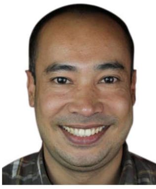
Fig1 Static photographs with posed smile taken in natural head position (NHP)

The individuals were asked to say "cheese" and then smile. Vertically, the photographs cropped from sub nasale and softtissue pogonion. Horizontally, the photographs were cropped by drawing a tangent on both the sides of the face at the zygomatic prominence.