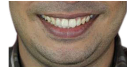
Fig 2 Photograph cropped vertically from sub nasale and soft-tissue pogonion and and horizontally by drawing a tangent on both the sides of the face at the zygomatic prominence.

Fig1 Static photographs with posed smile taken in natural head position (NHP)