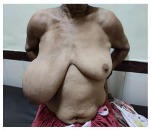
Figure 2 Clinical appearance of breast hamartoma