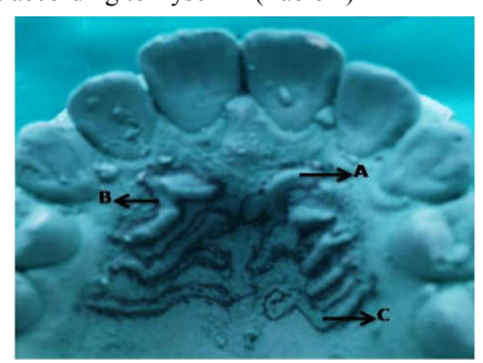
Figure 2 Tracing of palatal rugae a) Straight b) Curved c) Wavy

Permanent/ secondary impression was made using dental stone. On the secondary cast outine of the rugae were delineated with the help of graphite pencil. (Figure 2) Analysis of palatal rugae was done using magnifying lens and classified according to Lysell <sup>(8)</sup> (Table 2)