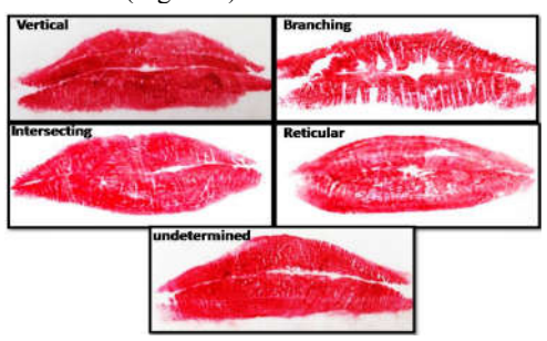
Figure 1 Lip print patterns

The study population comprised of 360 students in an age range of 17- 25 years. Half of the sample sizes were considered for lip print analysis and the other half for palatal rugae analysis. Birth month of all the participants were noted priorly. For lip prints, a dark colored lipstick was applied uniformly on the lips. A transparent cellophane strip was used to record lip prints and was then stuck on to a paper, for permanent record (Figure 1).